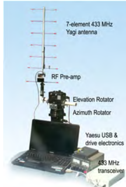
Figure 1: Rotator Assembly